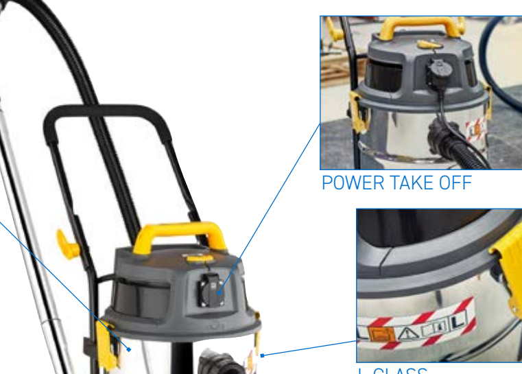
L CLASS DUST EXTRACTION