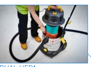
DUAL HEPA CLASS 13 FILTRATION

This durable twin fan motor delivers more power over an extended life time. Generating a max airflow of 52 L/s and 27 kPa vacuum pressure.